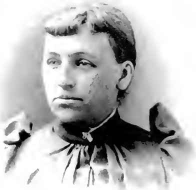
LIDE A. CHURCHILL.

of the first members of the Primrose League, the organization of the Conservatives, and it is largely due to her efforts that in Great Britain the order can boast of nearly 2,000 habitations. Lady Churchill is an effective worker in political campaigns, and she has thoroughly mastered all the intricacies of British politics. Besides her activity in politics, Lady Churchill devotes much well-directed effort to art and charity, and in British society she is looked upon as a great force. Born in the Republic, she illustrates the self-adapting power of the genuine American in the case with